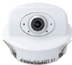
p26 camera, lens B016-B237