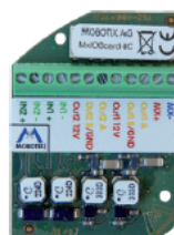
MxIOBoard-IC for signal input/output (accessories)