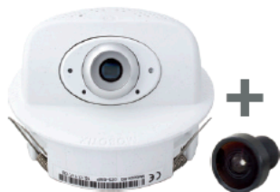
p26 camera body und lenses B036 to B237 for self-mounting